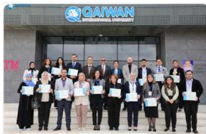
March 9, 2024: Certification at the Training and Development Centre