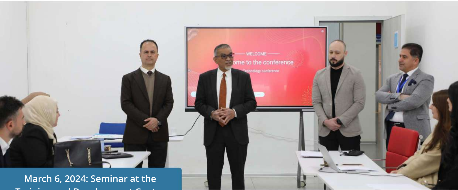
March 6, 2024: Seminar at the Training and Development Centre