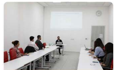
March 28, 2024: QIU Huawei ICT Academy

The Presidency of Qaiwan International University awarded certificates of participation to attendees of the training course titled "Active Researcher, Authentic Research. Financial Freedom," which was organised by Qaiwan International University's Development and Training Centre.